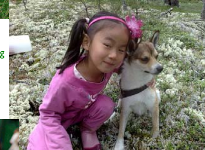
An excellent family dog