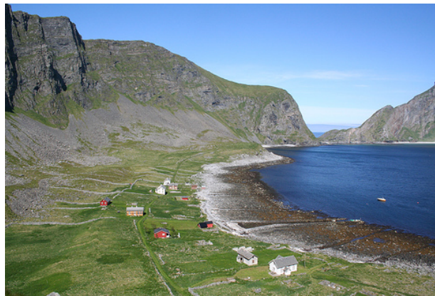
Måstad, Værøy