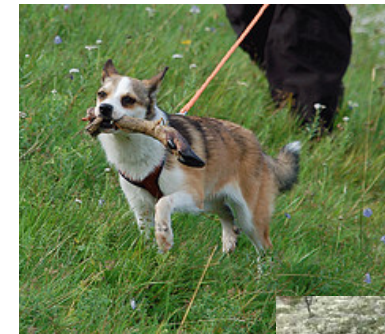
Lunde hund after successful blood tracking

Ref: Den norske hundeboka, Ulvund tekst & forlag.